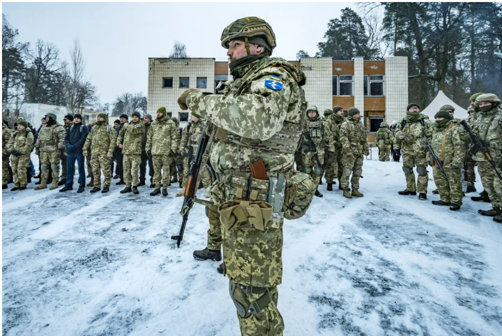
A military trainer with Ukraine's 112th Territorial Defense Brigade works with civilians during a military exercise outside Kyiv on February 5. The Ministry of Defense created defense brigades in Ukraine's main cities because of the risk of invasion by Russia, which is amassing troops at the border.