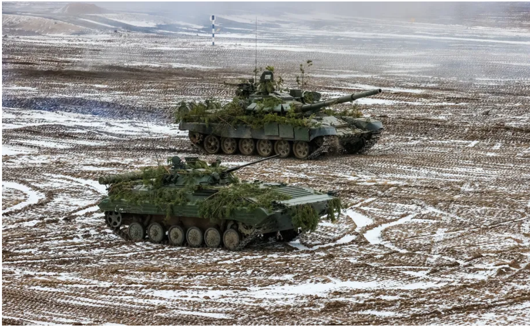
Russian and Belarusian forces conduct training exercises at a firing range in the Brest region of Belarus on February 3.

There are plenty of possible scenarios for a Russian invasion, including sending more troops into the breakaway regions in eastern Ukraine, seizing strategic regions and blockading Ukraine's access to waterways , and even a full-on war, with Moscow marching on Kyiv in an attempt to retake the entire country. Any of it could be devastating, though the more expansive the operation, the more catastrophic.