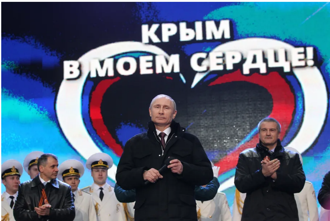
Russian President Vladimir Putin and the Russian-installed head of Crimea, Sergei Aksyonov, far right, attend a rally at Red Square in Moscow, Russia, on March 18, 2014, after Putin annexed Crimea from Ukraine.

Those assurances were put to the test in 2014, when Russia invaded Ukraine. Russia annexed the Crimean Peninsula and backed a rebellion led by pro-Russia separatists in the eastern Donbas region. (The conflict in eastern Ukraine has killed more than 14,000 people to date.)