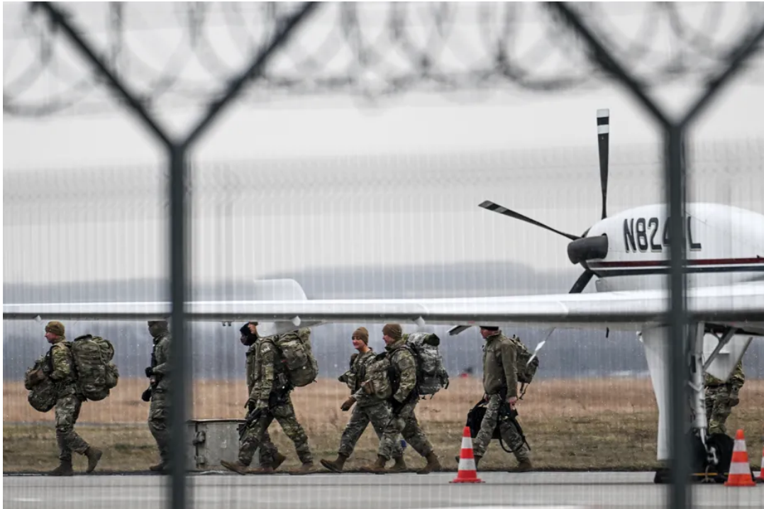
US troops exit a transport aircraft in Rzeszow, Poland, on February 6, as tensions between the NATO alliance and Russia continue to intensify.