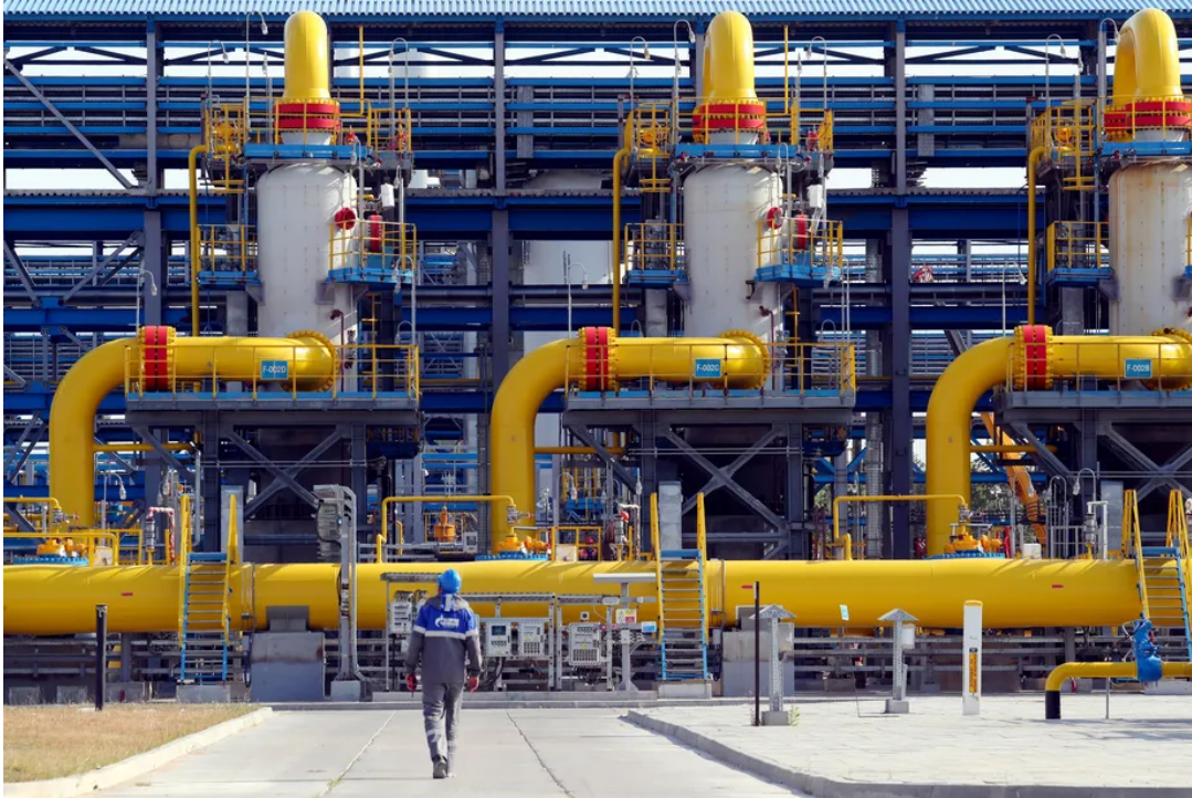
A worker at a compressor station for the Nord Stream 2 offshore natural gas pipeline, in Ust-Luga, Russia, in July 2021. Once operational, the Nord Stream 2 pipeline will supply gas from Russia to Germany.