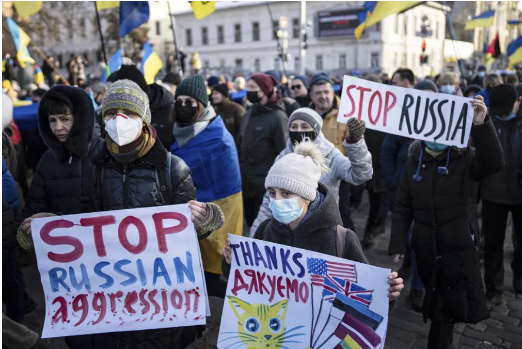
Demonstrators with Ukrainian national flags and posters march in the center of Kharkiv, Ukraine, on February 5. Kharkiv is Ukraine's second largest city, just 25 miles from some of the tens of thousands of Russian troops massed at the border.