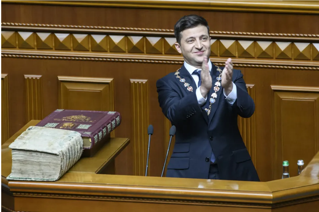
President-elect Volodymyr Zelensky claps during his inauguration in the Ukrainian parliament in Kyiv on May 20, 2019.

Zelensky, a comedian who played a president on TV and then became the actual president. In addition to the other thing you might remember Zelensky for , he promised during his campaign that he would “reboot” peace talks to end the conflict in eastern Ukraine , including dealing with Putin directly to resolve the conflict. Russia, too, likely thought it could get something out of this: It saw Zelensky, a political novice, as someone who might be more open to Russia’s point of view.